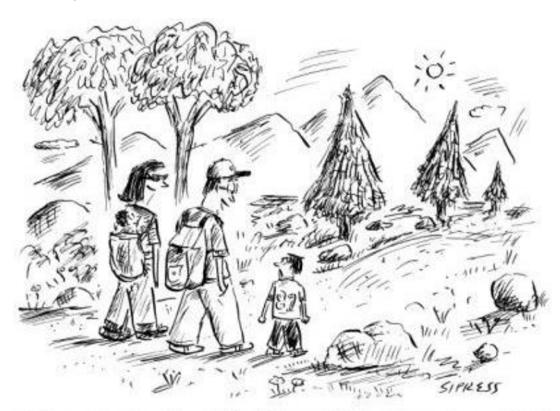
"What you hate is walking. This is hiking-hiking is different from walking."